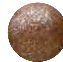
OLD GOLD "Z"