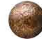
OLD GOLD SPOTTED "IT"