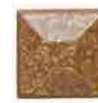
OLD GOLD "E"