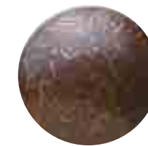
OLD BRASS ZINC