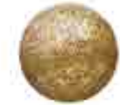
OLD GOLD "E"