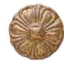
DECORATIVE OLD GOLD "E"