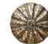
DECORATIVE OLD GOLD "E"